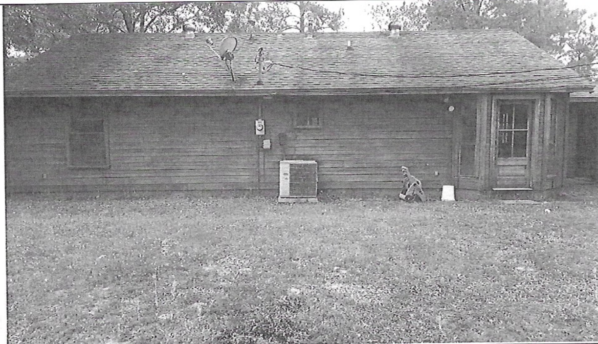
Photo Two Caption REAR VIEW - TAKEN 4/21/2018