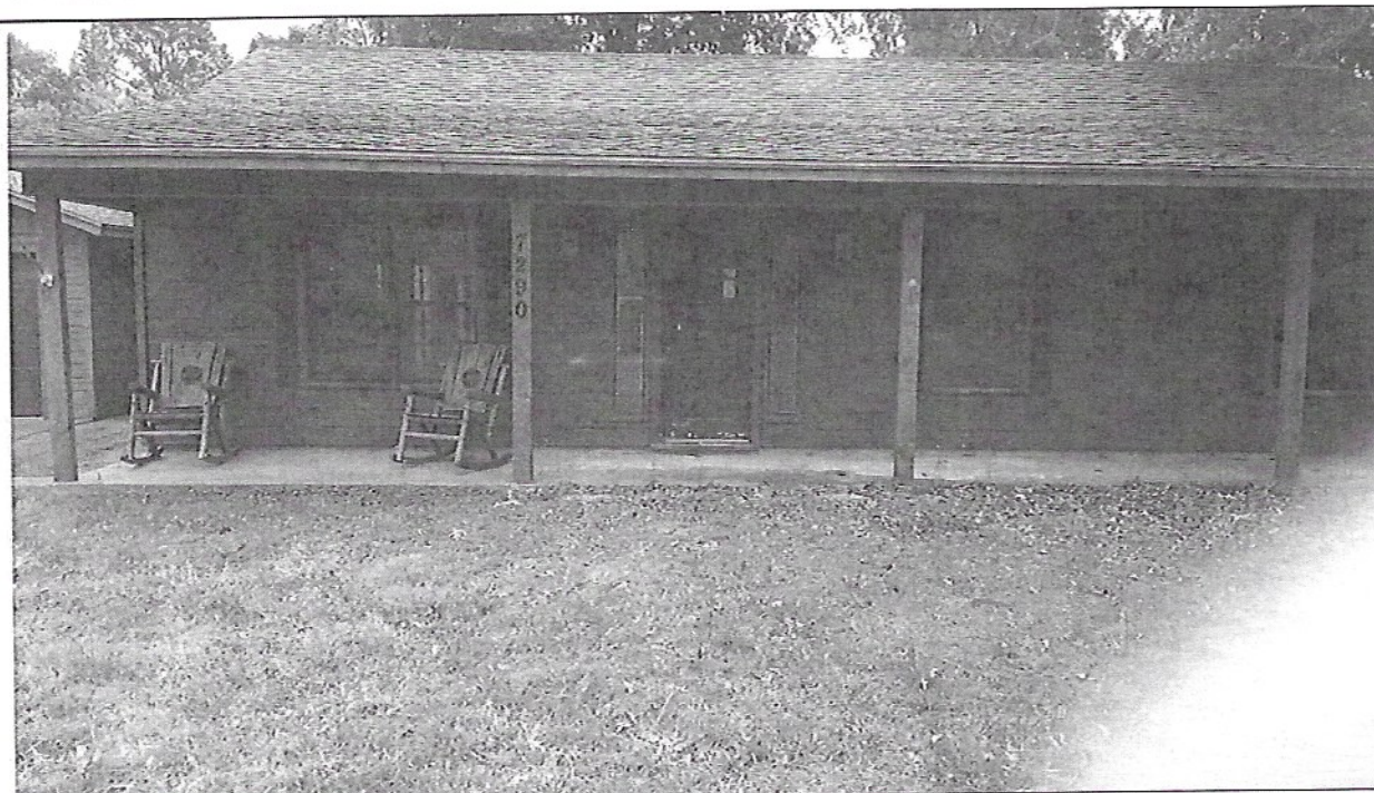
Photo One Caption FRONT VIEW - TAKEN 4/21/2018

If using the Elevation Certificate to obtain NFIP flood insurance, affix at least 2 building photographs below according to the instructions for Item A6. Identify all photographs with date taken; "Front View" and "Rear View"; and, if required, "Right Side View" and "Left Side View." When applicable, photographs must show the foundation with representative examples of the flood openings or vents, as indicated in Section A8. If submitting more photographs than will fit on this page, use the Continuation Page.