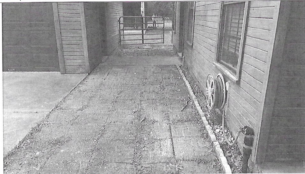
Photo Two Caption LEFT SIDE VIEW - TAKEN 4/21/2018