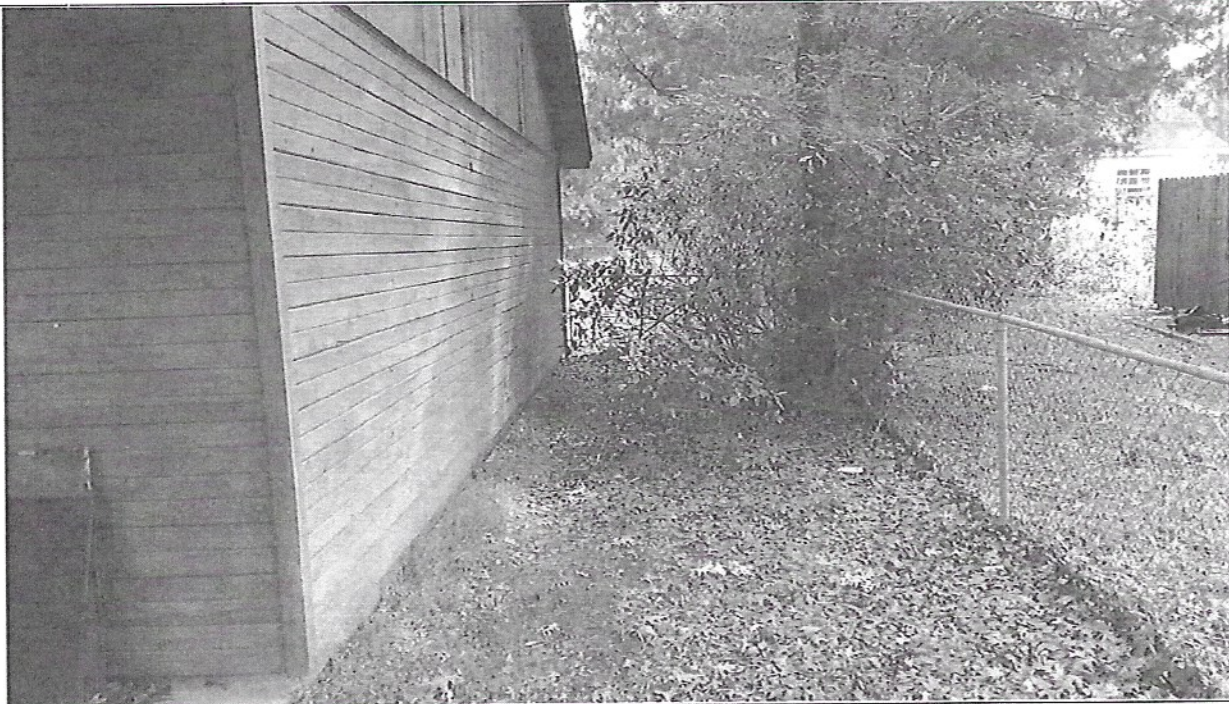
Photo One Caption RIGHT SIDE VIEW - TAKEN 4/21/2018

If submitting more photographs than will fit on the preceding page, affix the additional photographs below. Identify all photographs with: date taken; "Front View" and "Rear View"; and, if required, "Right Side View" and "Left Side View." When applicable, photographs must show the foundation with representative examples of the flood openings or vents, as indicated in Section A8.